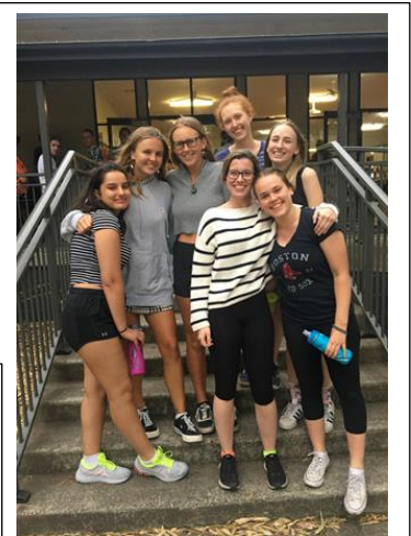
Ain't it so wonderful to reconnect with friends

If you do what you've always done ... you'll get what you've always got!