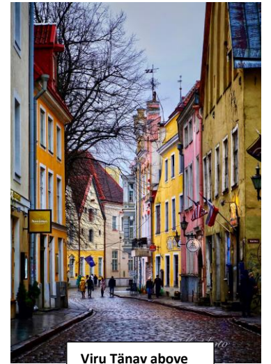
Viru Tänav above Eesti forrest below