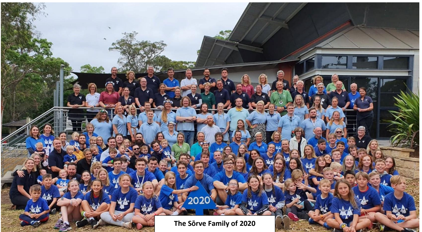
The Sörve Family of 2020

The games have been played, inspections made, songs have been sung and painting done, friendships have formed, others renewed, dances danced and swims swum.... and another Sörve draws to a close.