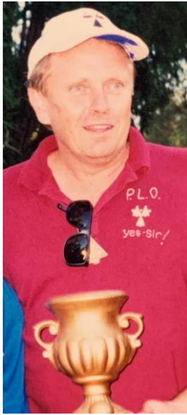
Puhka Rahu