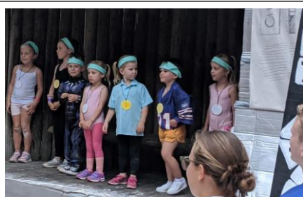
Aah the power of dressing up and getting immersed in character!