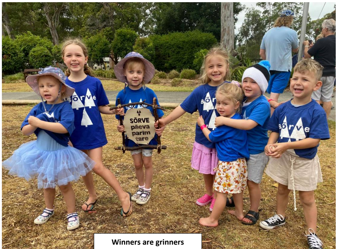
Winners are grinners

Weather: Sõrve Australia ; Chance of rain max 23 ° Sõrve Estonia Sunny max 4 °C