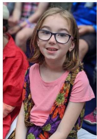
Sõrve is a lifestyle