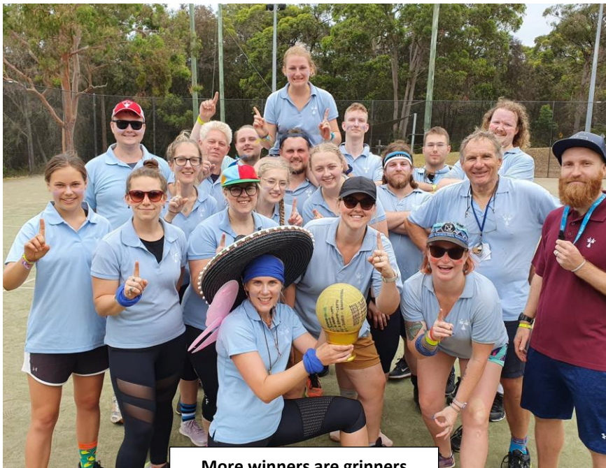
More winners are grinners